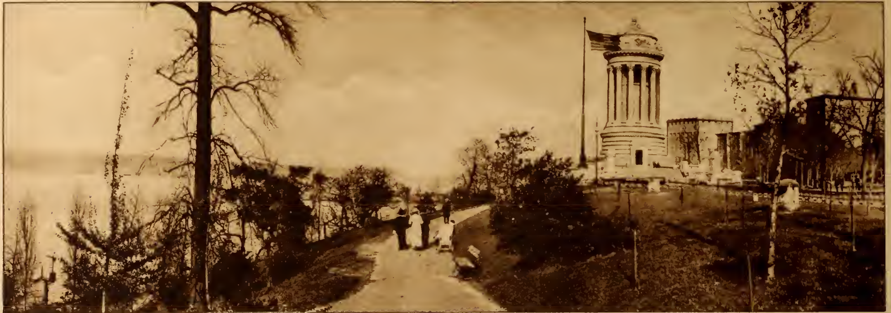
SOLDIERS' AND SAILORS' MONUMENT, on Riverside Drive, with a view of the Hudson River and Palisades.